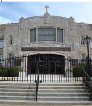
Historic Mason Temple Memphis, TN